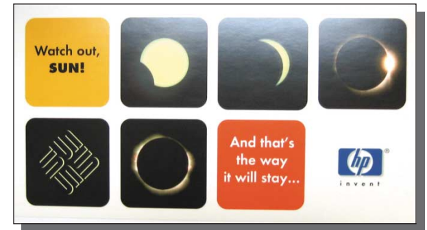
Teaser postcard sent before the official launch of the program and the kickoff package.