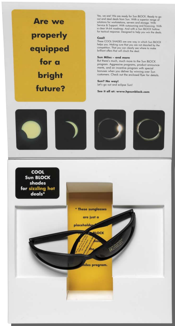
Kickoff incentive. The package contained an inexpensive pair of sunglasses with a tag urging the reader to register for the program. The first 500 people to register received a pair of original Ray-Ban sunglasses.

HP "Sun Block" mailer enticed HP sales representatives to register at a dedicated website and win great rewards for their sales efforts. Subsequent mailers reinforced the benefits of the program both for HP and for the individual sales representative.